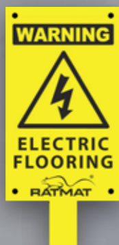
RatMat A4 warning sign